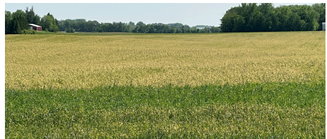
Steele County Cover Crops